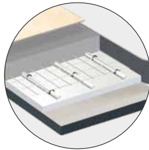
For heated floors