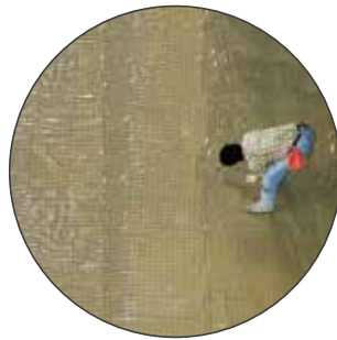
Example of installation